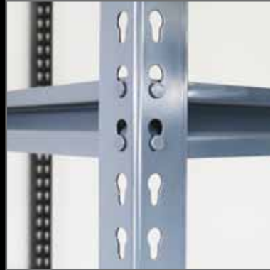
(60mm high) Zee beam up to 400kg per level

All information, specifications and details contained herein were correct at time of printing. BOS Systems Pty Ltd reserves the right to alter products specifications, details and prices, to delete and add product without notice as part of our ongoing product development. Colours shown are as accurate as the printing process will allow.