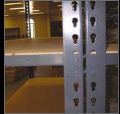
(30mm high) Low profile beam up to 100kg per level